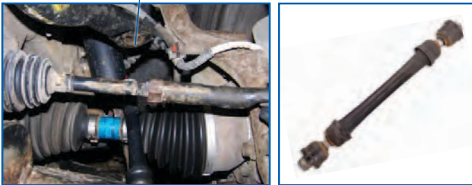
NOTE BROKEN SWAY BAR LINK

The sway bar link on affected vehicles comes in many styles. Other suppliers may utilize a small-diameter bolt. This small size makes the bolt susceptible to the damaging effects of road shock and corrosion. In addition, the neoprene bushings used in many of these links do not stand up well to stress and weather conditions. Also, other suppliers may use a rolled steel sleeve which can allow contaminants in, leading to corrosion and failure.